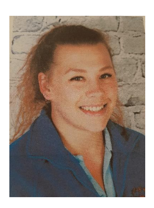
Qualifications and Training: