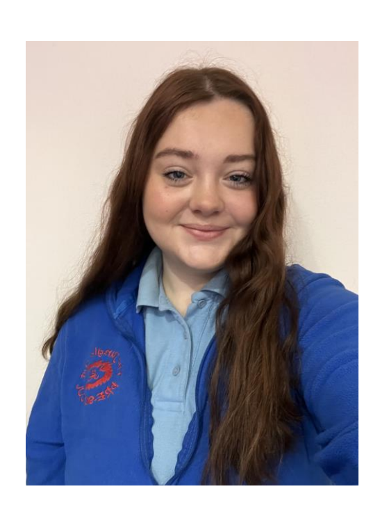
Qualifications and Training

Cache Level 2 – Introducing Caring for Children & Young People