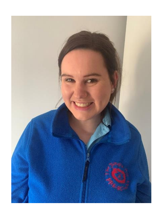
Qualifications and Training: NVQ's Level 2 & 3 in Childcare & Education Safeguarding Level 3