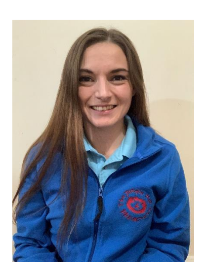
Qualifications and Training: Working towards NVQ Level 2 in Childcare Safeguarding Level 2 Paediatric First Aid